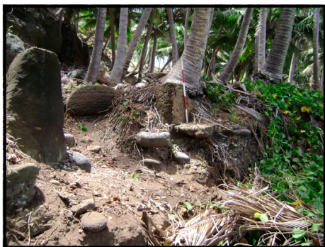
Latte Site on Pagan

Air Administration Building in the North Field National Historic Landmark