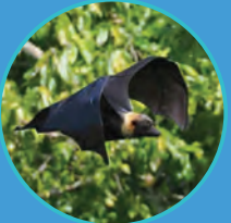
Mariana fruit bat ( Pteropus mariannus mariannus ) Threatened

Species with potential to occur in the action area