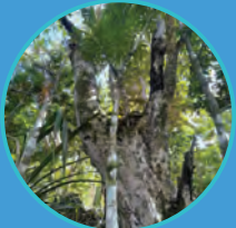
Heritiera longipetiolata Endangered