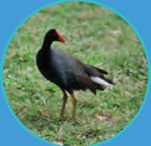
Mariana common moorhen ( Gallinula chloropus guami ) Endangered