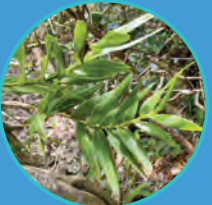
Dendrobium guamense Threatened