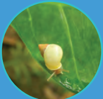
Humped tree snail ( Partula gibba ) Endangered