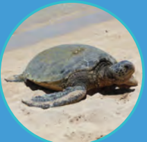
Green sea turtle ( Chelonia mydas ) Endangered