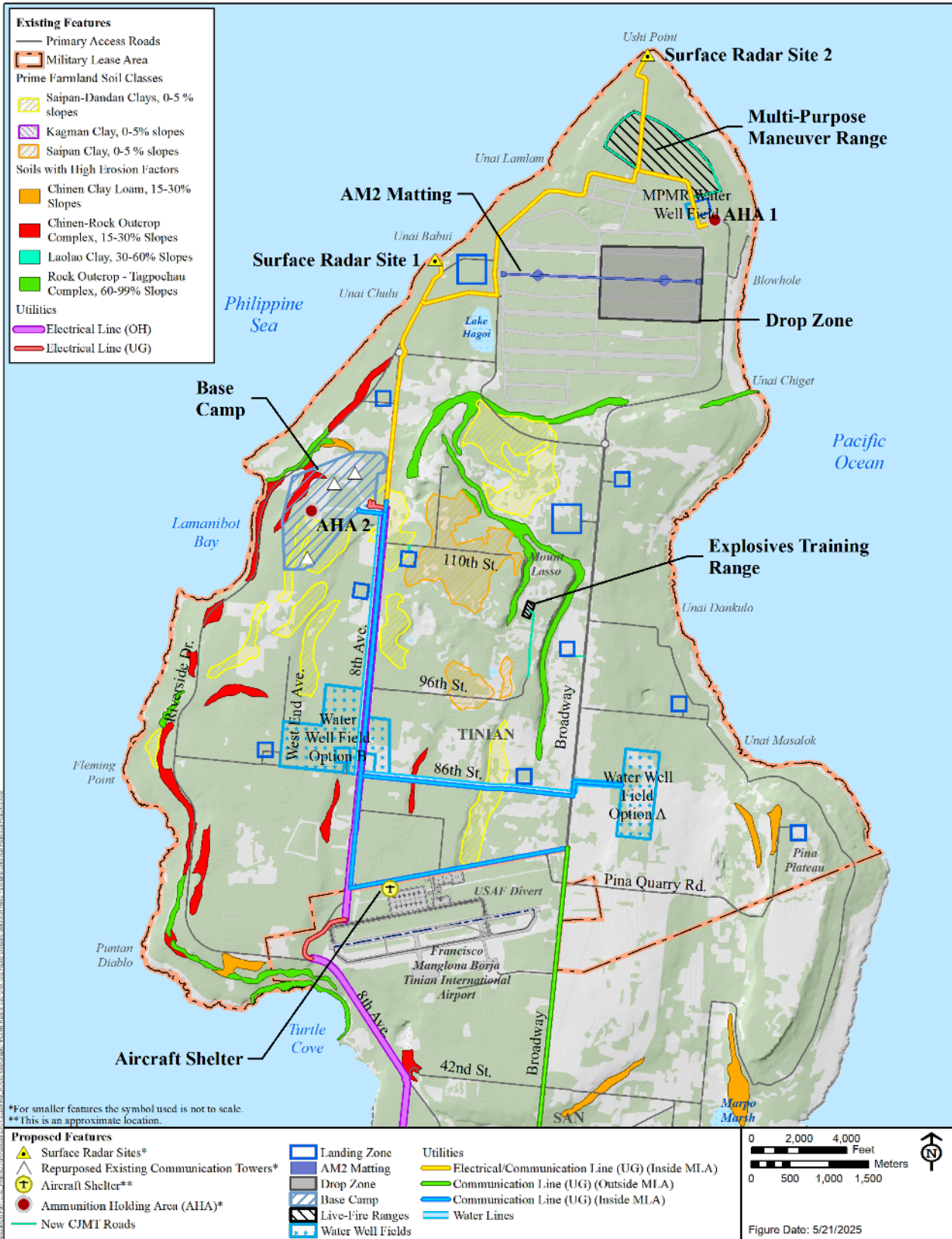
Figure 4.12-2 Highly Erodible Soils and Prime Farmland Soils in the Project Area