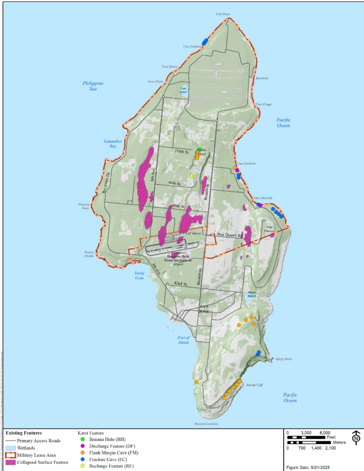
Figure 3.12-2 Tinian Karst Features