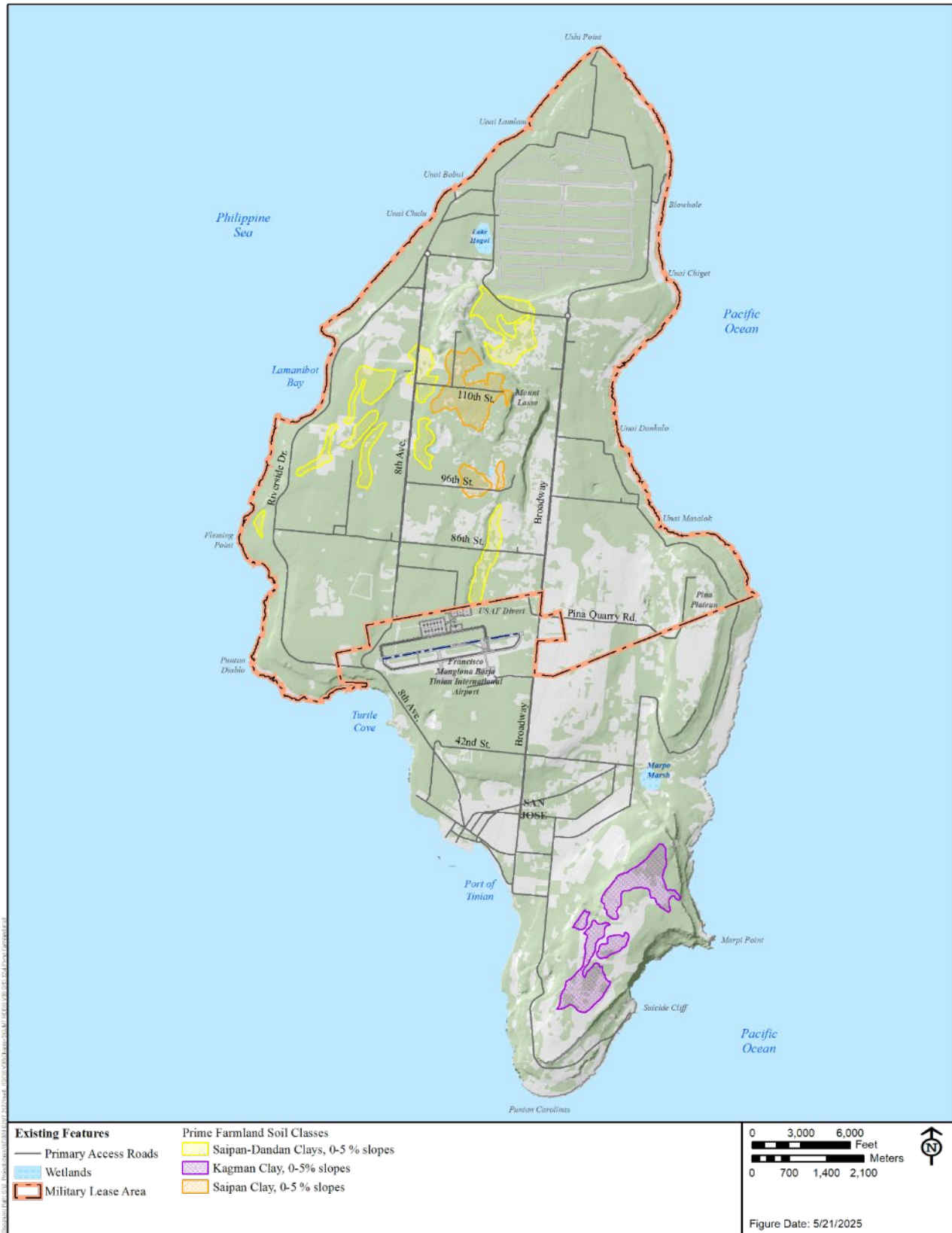
Figure 3.12-4 Tinian Prime Farmland Soils