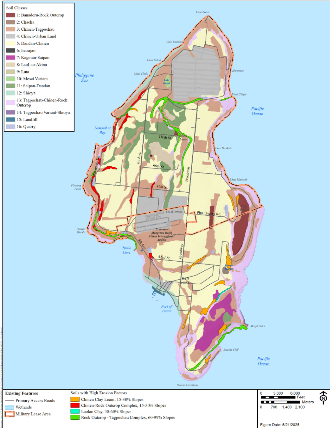
Figure 3.12-3 Tinian Soils