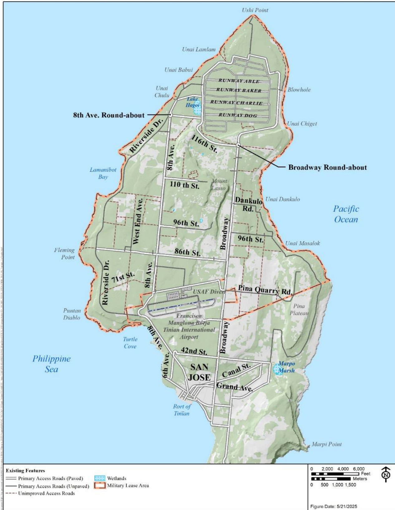
Figure 3.7-1 Existing Roads in and Near the Military Lease Area on Tinian